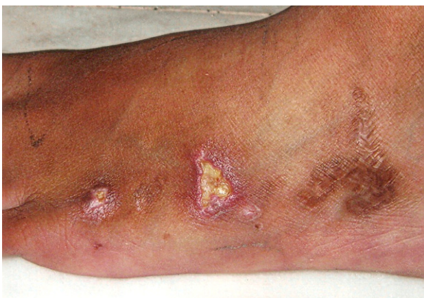
Fig. 1 – Ulcers on the left foot of the first patient before HBOT. Old scar from healed ulcers can also be seen.

The first case, a 22-year-old female presented with a three-year-old history of recurrent multiple non-healing ulcers involving feet and ankles (Fig. 1). The ulcers were associated with severe debilitating pain and paraesthesia, as a result of which she was unable to walk without support. Patient did not give any history of any other medical illness, or any systemic complaints. The ulcers were discrete, irregular in shape, erythematous, and surrounded by areas of inflammation.