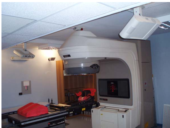
Fig. 1 – Photograph of the two camera pods (black arrows) of the surface registration system, mounted on the ceiling of the treatment room. The linear accelerator is also shown.

The commercially available 3D surface image registration system AlignRT (Vision RT, London, UK) was installed in a treatment room equipped with a linear accelerator with multileaf collimator and amorphous silicon EPID (see Fig. 1). The AlignRT system consists of two imaging pods mounted on the ceiling under an oblique angle of 30° with respect to the treatment table. Each pod containing two stereo-vision cameras, a texture camera, a clear flash, a flash used for speckle projection and a slide projector for speckle projection, acquires 3D surface data over approximately 120° in the axial plane, from midline to posterior flank. The data are merged to form a single 3D surface image of the patient. The system includes software designed to facilitate patient setup by surface-model acquisition and alignment by surface matching with a reference image that can be obtained at the time of first treatment session by extraction of the surface image from CT data. In