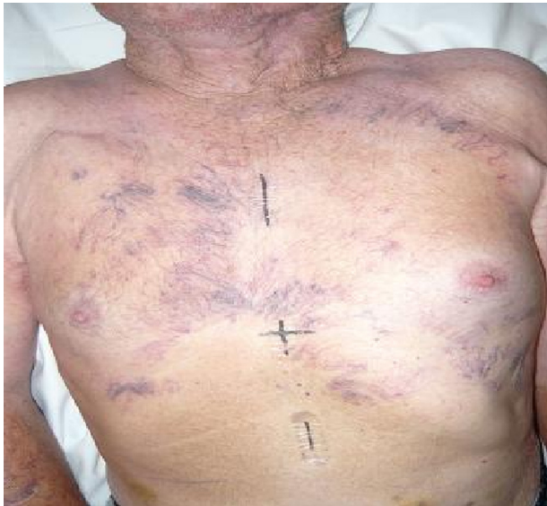
Fig. 1 – Anterior chest wall collateral vessels.

fraction utilized in stereotactic body radiotherapy (SBRT) has been proven highly efficacious in treating early stage NSCLC. Here we report the case of a patient with SVCS from NSCLC treated with SBRT in an attempt to alleviate his SVCS and simultaneously offer definitive treatment for his underlying malignancy.