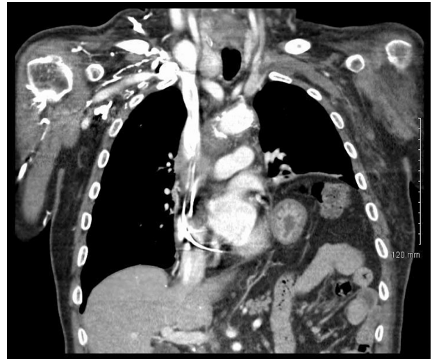
Fig. 2 – Coronal reconstruction of a CT of the thorax with contrast revealing occlusion of the superior vena cava secondary to a right paratracheal lymph node. Collateral vessels are apparent proximal to the obstructing lesion.

Given the patient's small overall volume of disease, small offending lesion size, and evidence of possible improved outcomes with large dose per fraction, SBRT was chosen as the