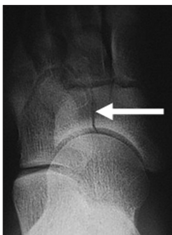
Figure 1: Stress fracture of the naviculum seen on plain X-ray. (White arrow)

Postoperative protocols were standardized and supervised. No cast was applied postoperatively. Patients were allowed