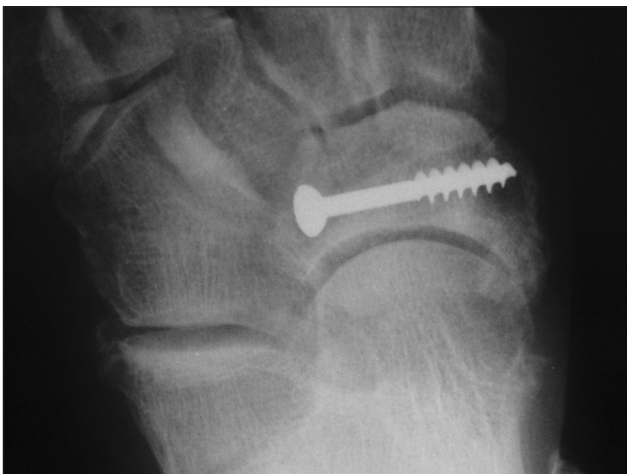
Figure 2: Plain X-ray anteroposterior view of midfoot showing navicular stress fracture fixed percutaneously with a lag screw

This study also shows that a minimally invasive procedure combined with immediate postoperative mobilization allows fracture healing to be achieved reliably in a predictable 3 month time frame with reduced delays in achieving pre-injury levels of performance for an athlete.