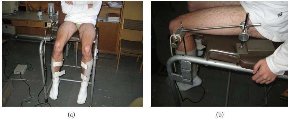
FIGURE 3: (a) and (b) are Goniometry pendulum test.