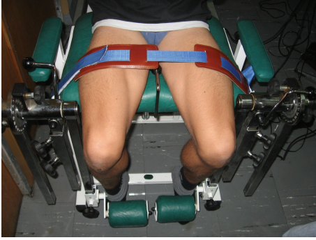
FIGURE 2: Tensometry.

measurements were performed before and after experiment (the measurements were in a supine position before the first and after the last NMES procedure).