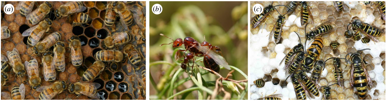
Figure 1. The behaviours of social insects, such as (a) the honeybee ( Apis mellifera ), (b) the fire ant ( Solenopsis invicta ) and (c) the yellowjacket wasp ( Vespula maculifrons ) have been shaped extensively by the process of kin selection. Social insects often exhibit phenotypically distinct castes, the evolution of which may be hampered by caste-antagonistic pleiotropy, particularly in species where queens mate with multiple males such as A. mellifera and V. maculifrons (see text for details). (Online version in colour.)