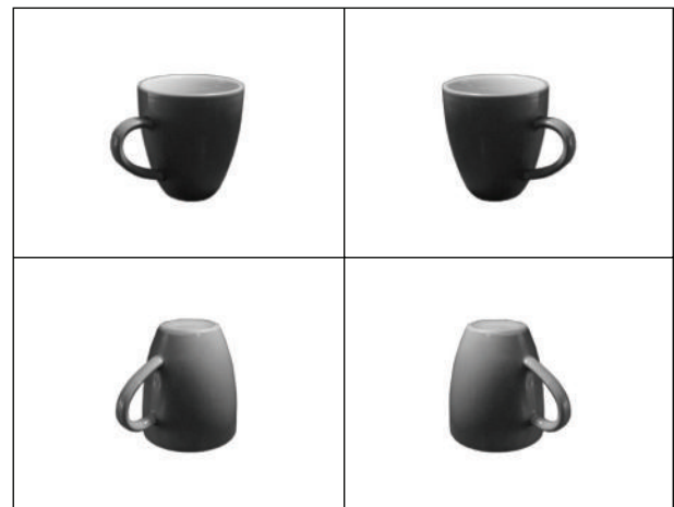
FIGURE 2: Examples of the stimuli used in Experiment 2: left orientation, upright; right orientation, upright; left orientation, inverted; right orientation, inverted.

3.3. Design and Procedure. Each participant carried out 2 blocks of 88 trials with a 3-minute pause between each block. These blocks differed in terms of response mapping (right hand-upright/left hand-inverted and left hand-upright/right hand-inverted) and were counterbalanced between subjects. They had to press the response key as fast and accurately as possible, with their right or left index, according to the vertical orientation of the objects (upright or inverted). Subjects kept their right finger on a right response key and their left finger on a left response key during the whole experiment. Depending on the situation, the response hand could be on the same side as the graspable part of the object (compatibility) or on the opposite side (incompatibility).