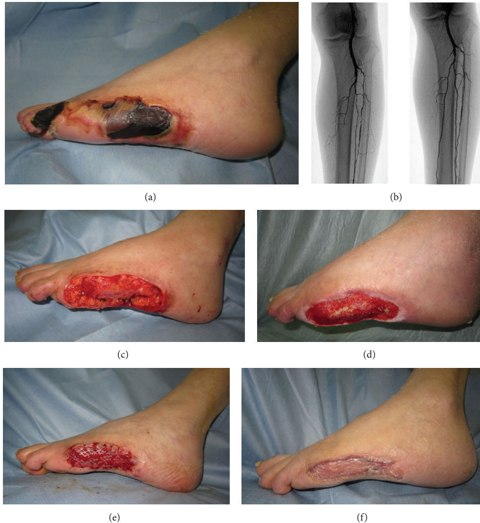
FIGURE 3: (a) Findings at first visiting our hospital: gangrene of the left 4th toe and skin necrosis of the lateral foot were observed. (b) Angiographic findings of the leg (left: before EVT; right: after EVT): occlusion of the left posterior tibial artery and stenosis of the anterior tibial artery and peroneal artery were observed; therefore, the 3 branches were dilated with a balloon. (c) Findings immediately after amputation of the left 4th toe and debridement: the left 4th toe was amputated at the metatarsal shaft, and skin necrosis of the lateral foot was removed. (d) Finding at the end of NPWT treatment using the V.A.C. ATS therapy system was performed for 3 weeks, and granulation was observed. (e) Finding immediately after split-thickness skin grafting: a skin graft with PRP (platelet-concentration ratio: 5.1x) was performed. (f) Finding at 2.5 months after the treatment.

and after evaluating the pathological conditions of the lower limb with various changes [9]. Our hospital also considers SPP as an indicator for selecting a treatment policy; however, we consider that clinical symptoms are the most reliable indicators, and we try to monitor the wound as much as possible. In addition, we actively select NPWT and PRP therapy with an understanding that it is important to promote wound healing and shorten the duration of treatment by various adjuvant therapies. NPWT is a wound care system initiative reported by Argenta and Morykwas [10] in 1997; it promotes a cure by locally applying negative pressure to the wound. Recently, the efficacy of NPWT has been widely recognized, and NPWT has been applied to the treatment