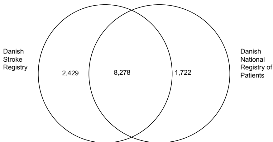
Figure 1 Number of patients registered with stroke in the Danish Stroke Registry, the Danish National Registry of Patients, and in both data sources in 2009.

Of the 156 medical summaries that were reviewed using the second approach, we identified 74 cases of acute stroke. Table 2 shows that based on data from the second approach,