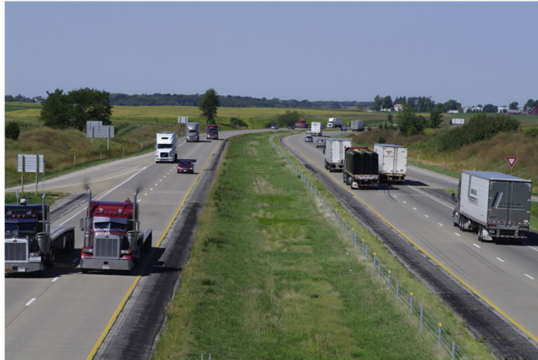
Fig. 3. The International Agency for Research on Cancer added diesel engine exhaust to the list of Group 1 carcinogens in 2012.