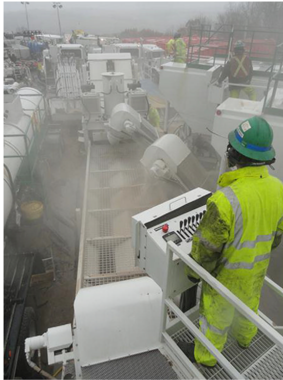
Fig. 4. Worker exposure to silica during hydraulic fracturing. Silica dust created by worker conducting sand transfer operations. Photo shows sand mover and transfer system.