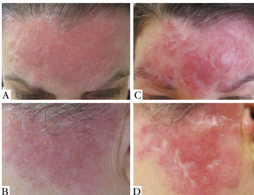
FIGURE 1: (A) Plaque of sarcoidosis on the frontal area and (B) on the left preauricular area just before adalimumab; (C) Plaque on the frontal area and (D) on the left preauricular area after 3 injections of adalimumab