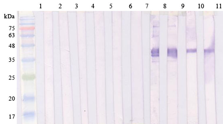
Figure 2 Anti-pkMSP-1 42 antibody detected in pkMSP-1 42 -immunized mice. Lanes 2–6, sera of mice injected with non-recombinant protein pRSET A at day 0, 7, 14, 21 and 31 post-immunization; lanes 7–11, sera of mice injected with purified pkMSP-1 42 at day 0, 7, 14, 21 and 31 post-immunization. Lane 1 contained protein size standards.

microheterogeneity comprising amino acid substitutions causing different alleles was observed in P. knowlesi MSP-1 33 epitopes [45]. Presence of sequence diversity in these epitopes may alter the immunological recognition of the epitopes and hence benefit the parasite survival by evasion of host immune response. For instance, Bergmann-Leitner et al. demonstrated that the P. falciparum anti-MSP-1 19 antibodies were allele-specific during inhibition of merozoite invasion and parasite growth [46]. Therefore, antibodies in some of the malaria infected patient sera in the present study could be unable to detect the variant epitopes on pkMSP-1 42 , which led to negative reactivity.