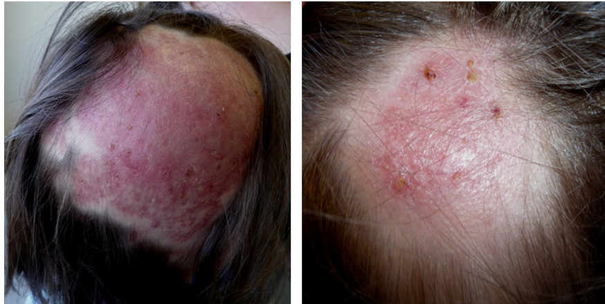
Fig. 1. Clinical course (day +30).

Bacterial cultures of the drainage taken at day 0 were negative. At day +5 of incubation a culture of dermatophytes grew on Sabouraud Dextrose Agar, identified as M. audouinii by conventional and molecular methods Fig. 3 and Fig. 4. At follow-up visit on day +15 the appearance of her scalp was improved, however large areas of alopecia were observed. We added sertaconazole 2% shampoo and petrolatum for removing the residual crusts. The patient was clinically and mycologically cured at day +70 and alopecia completely resolved in two months Fig. 1 and Fig. 2.