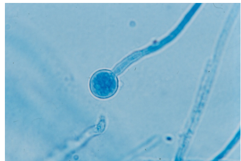
Fig. 4. Slide-culture examination.