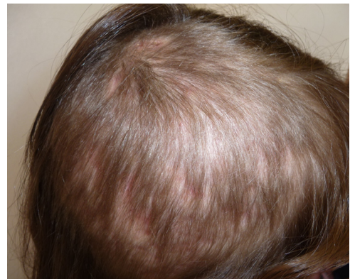
Fig. 2. Clinical course (day +110).

The main treatment of kerion celsi requires prompt systemic therapy, because topical agents do not penetrate in the hair follicle [10,11]. Griseofulvin is the treatment of choice for cases caused by Microsporum species, and it has a long-term safety profile [12]. Nevertheless, as it was not easily available for prescription in our country, we opted to give terbinafine, a