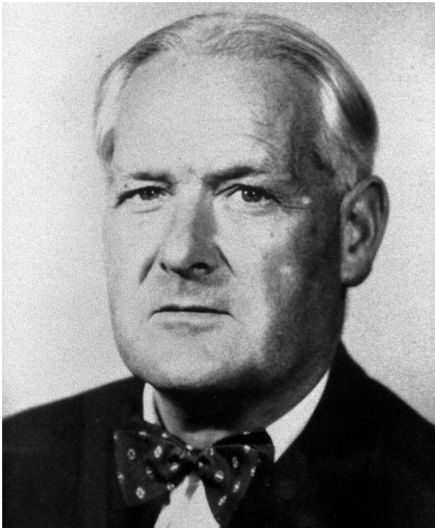
Figure 1. Portrait of Sir Austin Bradford Hill.