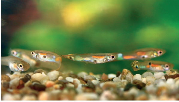
Figure 1. Male guppies ( Poecilia reticulata ) from the Lower Tacarigua (Trinidad) population used in this study.

( Artemia salina ) and commercially prepared dry food (DuplaRin). Males and females used in the experiments derived from large stock tanks (150 L), each containing approx. 50 individuals of each sex that were allowed to breed freely. Effective population size was constantly kept above 500 individuals. Haphazardly, once or twice a year, 50–100 virgin females were mated singularly with an equal number of individual males and all the produced offspring was recruited in the stock population in order to preserve genetic variation. Indeed, the number of alleles and the heterozygosity at three neutral microsatellite loci used for paternity analysis did not show signs of decrease from 2002 to 2011 (Evans et al. 2003; Gasparini et al. 2010a; Boschetto et al. 2011; Gasparini and Pilastro 2011). Virgin females (4 months old) were reared in single-sex groups under the same temperature, light, and food regimes as the stock fish.