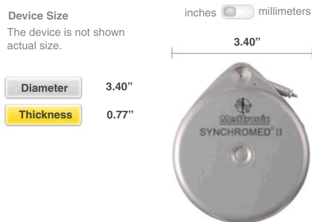
Figure 2. © 2009 Image of the SynchroMed II Pump with specifications. Pump is programmable to deliver a specific amount of medication at different times and can be increased or decreased depending on the individual's needs. Reprinted with the permission of Medtronic, Inc.

The Medtronic SynchroMed II infusion system comes with a Patient Therapy Manager (PTM) which is a trademark of the Medtronic Corporation 11 . It is a remote hand-held device which communicates with the implanted pump and allows the patient to self administer boluses based on the medication limits which are pre-programmed by the clinical provider. This system gives patients the ability to activate a bolus option when adequate pain relief is not achieved. The clinical care provider has the ability to set the number of boluses