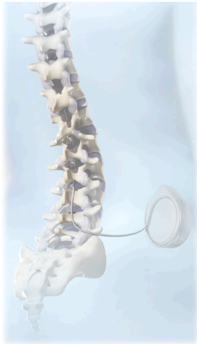
Figure 1. Image of the spine illustrating placement of the catheter into the intrathecal space which is connected to an implanted pump containing the drug reservoir.

There is a spectrum of intrathecal system options that range from a percutaneous catheter/external pump to a totally implanted system. Choice is dependent on a number of factors including, but not limited to, life expectancy, cost and availability of professional expertise and patient's wishes and comfort level.