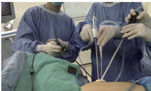
Figure 4 Single-port VATS for right subcarinal lymph node dissection.

VATS lobectomy, and for the new learner starting VATS lobectomy.