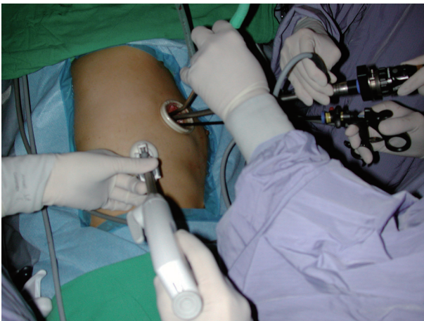
Figure 1 Two ports VATS—Transection of right superior pulmonary vein.

VATS, video-assisted thoracoscopic surgery.