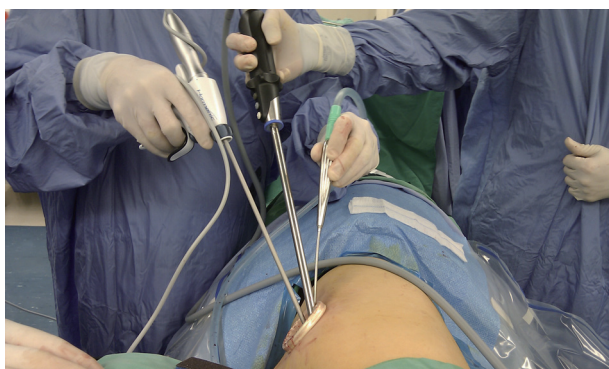
Figure 3 Relative positions between the surgeon and cameraman during single-portright superior mediastinal lymph node dissection.