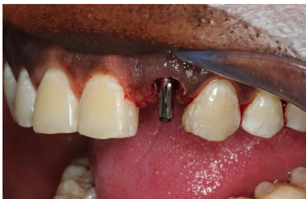
Figure 12: trunnion universal Neodent.

maintaining the integrity alveolar. The literature shows that the atraumatic extraction may be indicated especially when there is a thin thickness of bone tissue. In the same way, implant placement immediately after