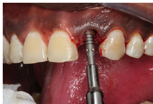
Figure 11: Implant installation - Neodent morse taper 3.75 x 11.5

the final outcome of prosthetic rehabilitation, it provides greater tissue preservation alveolar bone and adjacent soft tissue. 6,9 This has resulted in a lower possibility of changing the volume and contour of the tissues and, consequently, satisfactory aesthetic results. The method used for extraction and the manner in which the alveolus after the extraction is treated can influence the degree of preservation of the alveolar bone. 14 Various techniques have been proposed for this purpose, 8,15-17 with the use of dental extractor is a method which allows in a simple way and with a minimum of trauma to extract the tooth while