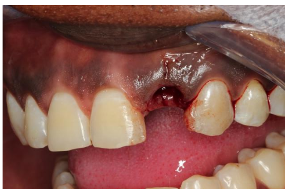
Figure 9: alveolus after extraction with minimal trauma.