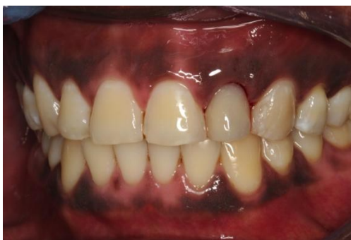
Figure 13: Placement of immediate provisional restoration.

maintaining the integrity alveolar. The literature shows that the atraumatic extraction may be indicated especially when there is a thin thickness of bone tissue. In the same way, implant placement immediately after