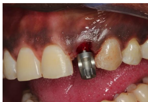
Figure 5: Pin tractor fixed in the root canal.