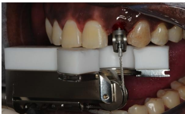
Figure 6: Extractor dental positioned and fixed to the pin tractor.

the direction of the long axis of the tooth. With this, there was obtained the periodontal ligament rupture