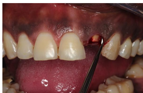
Figure 3: Sindesmotomia with minimal trauma.