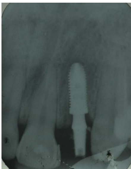
Figure 15: Radiographs after implant installation.

tooth extraction has been proposed in order to avoid reabsorption and breakdown of tissues after extraction, 12,18 and decrease time to treatment. 19 The