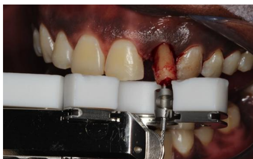
Figure 7: Extrusion of tooth with root retractor.

the direction of the long axis of the tooth. With this, there was obtained the periodontal ligament rupture