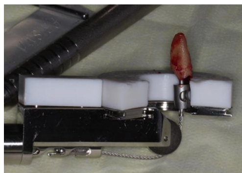
Figure 8: Extruded tooth root retractor.

The achievement extraction atraumatic is a surgical technique that can present major clinical advantages in