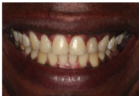
Figure 14: Post placement of provisional restoration.

Another aspect of great importance, after immediate implant placement, consists in proper preparation and