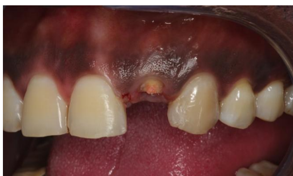
Figure 1: Initial clinical case where one observes amount of remaining reduced tooth.

Subsequently, the conical tips of the steel cable was seated in the tractor pin. The cable was stretched until they fit into one of the hooks of the drive axle puller tooth (Figure 6). The traction was done according to