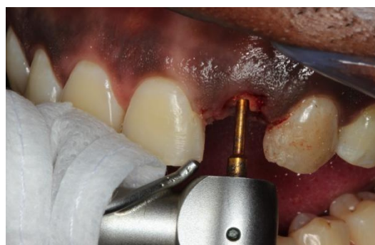
Figure 4: Preparation of conduct for fixing pin tractor.