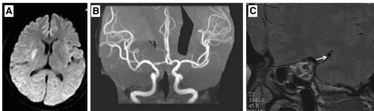
Figure 2 MRI, MRA and HR MRI findings of Case 2. (A) MRI diffusion weighted image shows a hypersensitive lesion on posterior limb of internal capsular. (B) MR angiography of the MCA is normal. (C) High-resolution MRI of MCA indicates the presence of an atherosclerotic plaque on the frontal wall of the right proximal MCA.

This is the first study to date on HR MRI findings of MCA cross-section in patients with CWS. Capsular infarctions were demonstrated in the territory of a lenticulostriate artery on DWI in both 2 patients. Although cerebral vascular angiography showed no abnormalities, HR MRI disclosed atherosclerotic plaques on the ventral