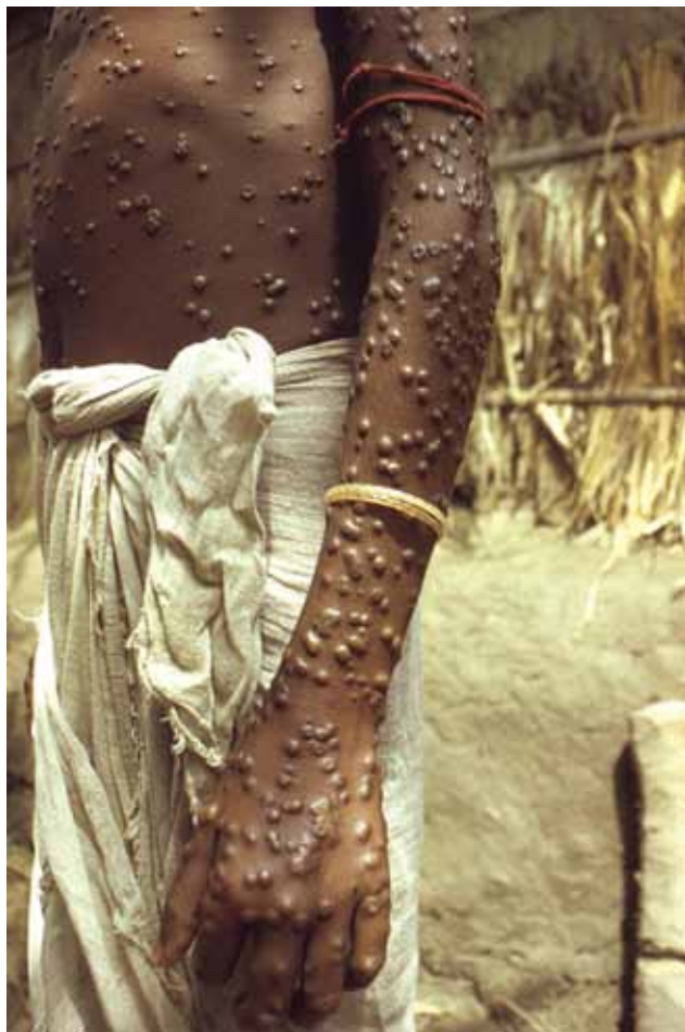
Figure 1. Patient with smallpox.

accidental or intentional release could cause illness in a population increasingly composed of unvaccinated persons. Anecdotal reports and formal scientific evidence have not ruled out the possibility that the virus may survive prolonged periods in preserved skin and tissue material, such as those that might be on display in museums, or in unearthened human remains. For example, permafrost is an environment that closely mirrors laboratory freezer storage of live virus, and the maintenance of viable smallpox virus in human remains found in such an environment has been debated (8). Environmental contamination with potentially live variola virus recovered from historical relics could threaten our confidence that the disease has been eradicated. In addition to immediate public health concern about such relics, there is much to be gained from investigation of artifacts in terms of scientific and historical interests.