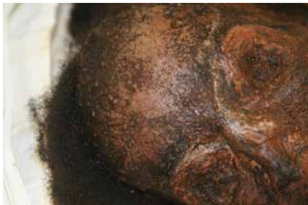
Figure 2. Mummified remains of a woman buried in an iron coffin, New York, New York, USA, mid-1800s.

for \leq 8 years before successful use (34). Thus, long-term storage and subsequent use of variola virus from preserved specimens have long been recognized. However, during the era of eradication, 45 scab specimens were collected from variolators and tested 9 months after collection; live virus was not isolated from any of the specimens (35). Nevertheless, stored crusts have caused immediate concern for potential exposures and their discovery has caused immediate exposure mitigation and testing.