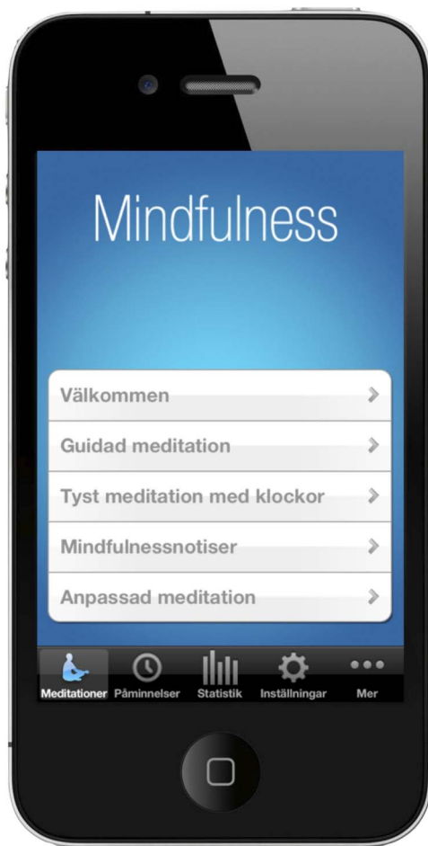
Figure 3 Screenshot of the Mindfulness application (the native version).

current treatment week, and send this reflection to their therapist via email. The participants received personal feedback on their reflection from their therapist.