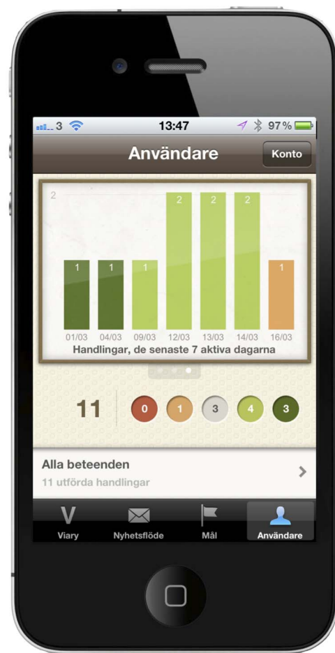
Figure 2 Screenshot of the BA application (the native version).

The smartphone application was built as a native application for iPhone, meaning that the application was coded in a specific programming language (objective C), and as a mobile web application for other smartphones. See figure 2 for a screenshot of the application. A prototype of the smartphone application was tested in a pilot study. 49 This prototype, however, was not specifically designed for depression interventions. The purpose of the BA application was to make it easy for the participant to remember and register important behaviours in order to increase everyday activation. The application contained a database of 54 behaviours, divided into three different areas for the participant to add to their application. See box 1 for the list of behaviours from the database. The database aimed to provide suggestions,