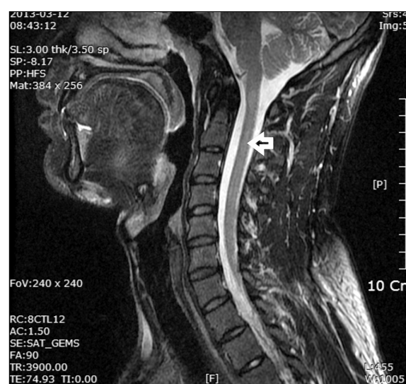
Fig. 2. Marked improvement of previous intramedullary high signal intensity at cervical spinal cord, since last MRI.