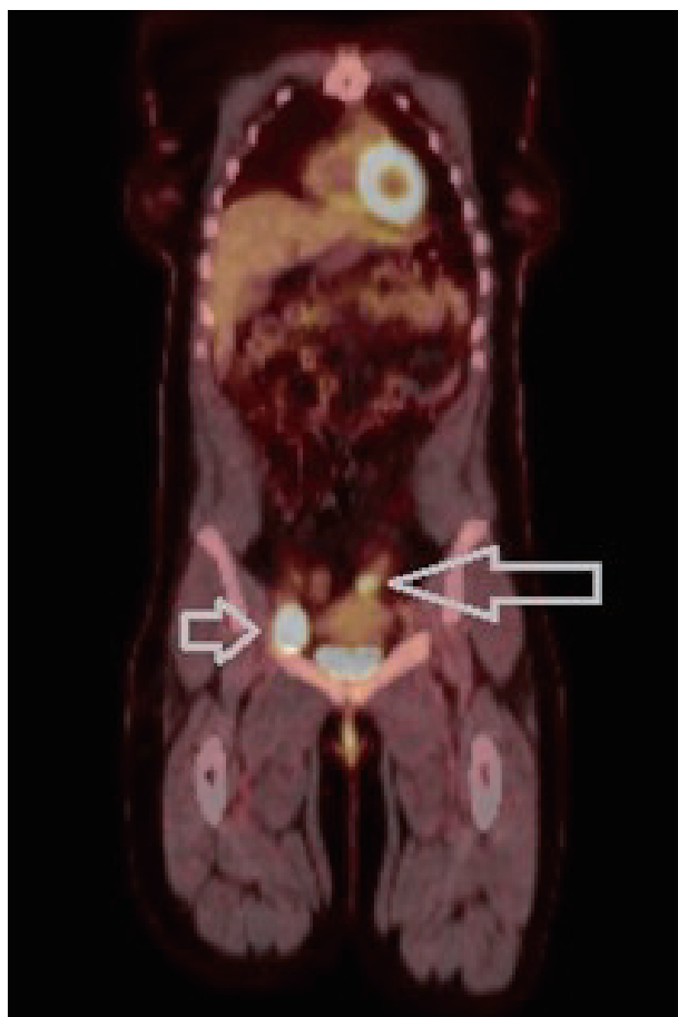
Figure 3 PET-CT done after superficial right groin dissection showing hypermetabolic FDG uptake in the right groin (short arrow) as well as a hypermetabolic soft tissue mass in the left hemipelvis (long arrow). Both were suspicious for recurrent.

The patient continued to undergo routine surveillance postoperatively. A physical exam and PET-CT was performed every few months. Approximately seven months after her superficial groin lymph node dissection a routine surveillance PET-CT demonstrated a prominent right groin lymph node measuring 4.2 cm × 3.1 cm significantly larger compared to previous examination and now highly FDG-avid (SUV 19.5) (Figure 2). There was also a new soft tissue mass measuring 3.2 cm × 2.6 cm superior and lateral to the left aspect of the uterus showing increased FDG uptake (SUV 6.6). These two lesions were highly suspicious for recurrent disease (Figure 3).