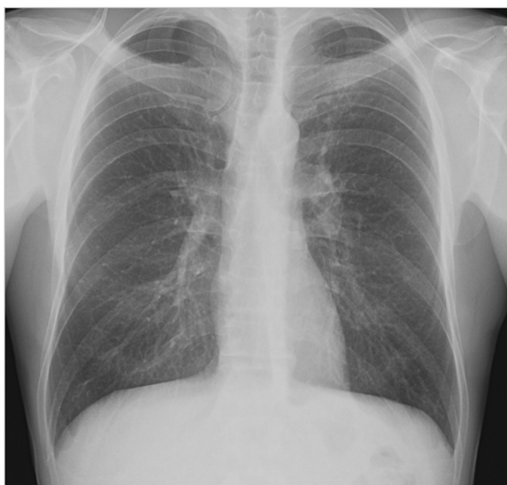
Figure 3 Follow up (post-operative) chest radiograph (PA view) of the patient showing a normal lung parenchyma of the left apex.

[Figure 3]. The patient ceased tobacco consumption since surgery, supported by Varenicline (Champix®, Pfizer, New York, USA). One year follow-up revealed no recurrence, no intercostal pain syndrome and preserved pulmonary function.