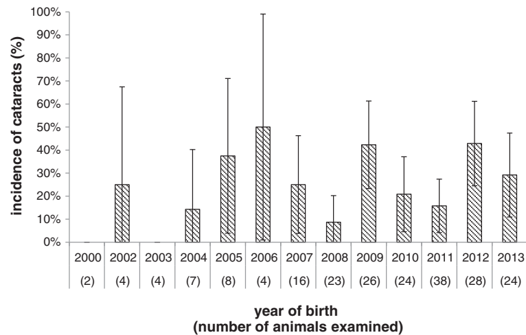
Figure 2 Incidence of congenital cataracts by year of birth with a confidence interval of 95% (represented by error bars).

in 2011. Unlike anophthalmia, mild cataracts can easily be missed with the naked eye. These cataracts are non-progressive. On the contrary, as the lens grows, the effect of the lesion is likely to decrease. That might account for the fact that younger animals appeared more severely affected in comparison to older animals, even though it was not statistically significant. In spite of small number of bulls on this farm, there is a trend showing male animals might be at higher risk for this condition, which is consistent with other reports [13].