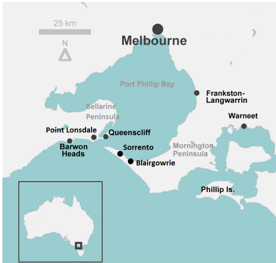
Figure 1. Map showing the Mornington and Bellarine peninsulas, and locations of towns referred to in the text. doi:10.1371/journal.pntd.0002668.g001