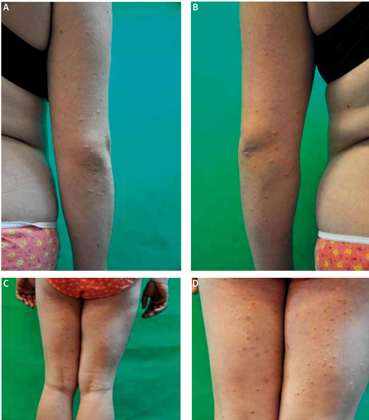
Figure 1 A–D. Clinical picture of lesions

vastatin and rosuvastatin) was started. The patient was also referred to the Clinic of Metabolic Diseases for further diagnosis and combined hyperlipidemia therapy.