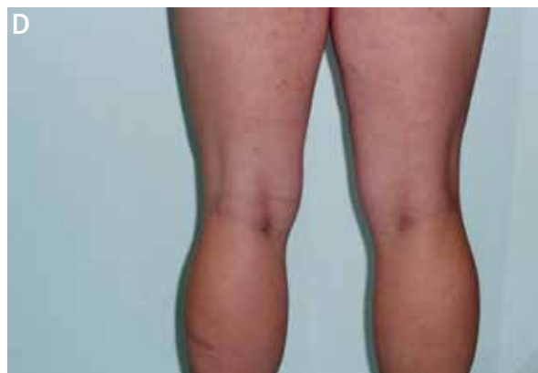
Figure 4 A–D. Clinical picture after therapy

quired hyperlipoproteinemia in the course of such diseases as adult-onset diabetes, hypothyroidism and nephritic syndrome. A therapy with some medicines e.g. retinoids or estrogens, may also result in secondary hyperlipidemia. A few cases of sarcoidosis coexisting with eruptive xanthomas were also described [10].