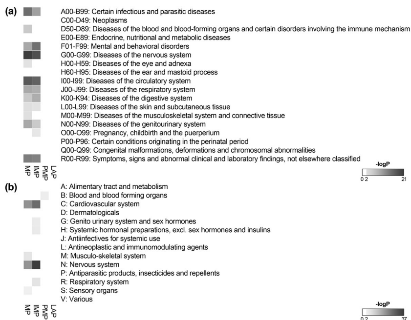
Figure 2 Heatmap representing the degree of associations between disease/therapeutic classes and membrane proteins. The disease associations were measured with first level classes of the ICD-10-CM, which were used to integrate the disease and drug information (a). For the therapeutic associations, the first level codes of ATC, which were used for the classification of integrated drugs depend on their therapeutic characteristics, were used (b). The degree of association was measured by hypergeometric test with FDR multiple testing correction. Only significantly enriched results with p-value below 0.01 are colored in the diagram. MP means all membrane proteins in this database.

external databases. Each annotated feature in the protein information page can also be used to search for other proteins that have the same feature, by clicking the search icon next to the feature. Users can also retrieve the integrated source information which is reason for collecting the protein as a membrane protein and allocating the protein with current class annotation.