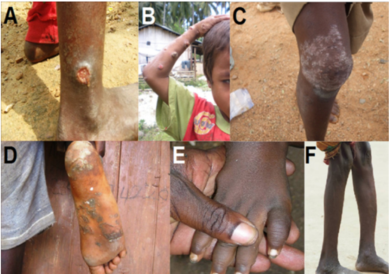
FIG 2 Clinical manifestations of yaws. (A) Early (primary) yaws: infectious skin lesion known as “mother yaw” on the ankle. (B) Early (secondary) yaws: infectious ulcero-papillomatous lesions on the arm. (C) Early (secondary) yaws: scaly maculae of irregular shape on the knee. (D) Early (secondary) yaws: plantar hyperkeratosis with painful cracks and fissures. (E) Fusiform swelling of the fourth digit in a yaws patient with dactylitis. (F) Saber shin, caused by chronic osteitis. (Panels A, C, and D are courtesy of Cynthia Kwakye and the Ghana National Yaws Eradication Program, reproduced with permission. Panel B is courtesy of Christina Widaningrum-Mkes and the Ministry of Health of Indonesia, reproduced with permission. Panels E and F were originally taken by Laurent Ferradini and are reprinted from reference 336, published under a Creative Commons license.)

raspberry (hence the African and French names) (Fig. 2A). The primary lesion, called “mother yaw” (buba madre or mamapian) is often found on the lower extremities, but can also occur on the patient’s buttock, arm, face, or hand (24–26). Teeming with treponemes, the mother yaw is highly contagious and can persist for weeks or months before healing spontaneously, often leaving a hypopigmented or depressed area delimited by a dark border (27). Groups of small dry papules have been reported as the initial manifestation instead of a mother yaw, but the lack of observable primary lesion is quite rare (28). At this stage, regional lymphadenopathy and arthralgia may also occur (25, 29). In the majority of cases, the primary lesion heals spontaneously before the onset of yaws’ secondary manifestations, whose appearance is due to the pathogen’s systemic dissemination during early infection. In 9 to 15% of the patients, however, the mother yaw is still present when the “daughter yaws” appear. The development of secondary lesions can, however, also be delayed as long as 1 to 2 years from the initial exposure. Secondary papules (pianomas or framboesias), although smaller, may resemble the mother yaw or may appear as scaly maculae of irregular shape (Fig. 2B and C, respectively). The daughter lesions can also expand and ulcerate, releasing a highly infectious fluid. Flies ( Hippelates pallipes ) are attracted to the oo-