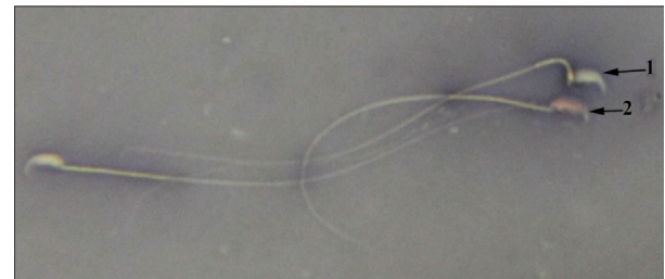
Figure 1. MTX+EP group, live sperm; 1: with uncoloured head and dead sperm; 2: with red head (Eosin Y Nigrosin ×1000)

Sperm parameters: The results revealed that sperm count decreased significantly (p<0.05) in methotrexate group in comparison with the control group. Ethyl pyruvate+methotrexate group revealed significant enhancement (p<0.05) in sperm count which are presented in table 1. There was no significant (p>0.05) difference in sperm maturity among groups. Treatment with anti-neoplastic drug (MTX) caused a significant decrease in viability and an increase in sperm with damaged DNA compared with the control group while Ethyl pyruvate caused improvement in viability and DNA fragmentation in MTX+EP group (Figure 1, 2, 3; Table 1).