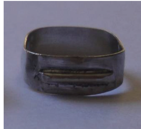
FIGURE 2: Laser soldered band (LSB).

cadmium has been considered a mutagen and may be related to the occurrence of cancer [10–12].