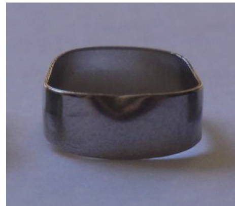
FIGURE 3: Band without any solder (as received—WSB).

This study was approved by the ethics Committee from Pontificia Universidade Católica do Rio Grande do Sul (Porto Alegre, Brazil). Stainless steel metallic orthodontic bands