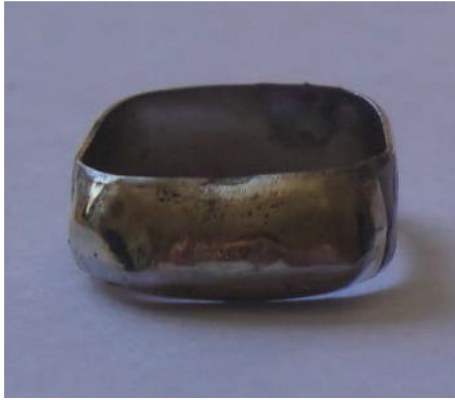
FIGURE 1: Silver soldered band (SSB).