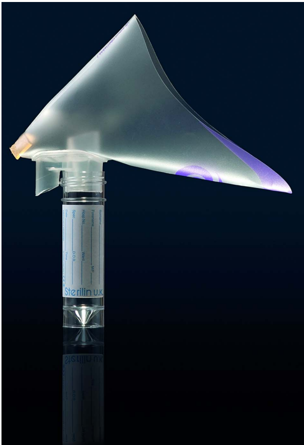
Figure 1 The Peezy device.

the funnel device and hold it against the perineum where marked on the funnel, then 'let the urine flow'. Once completed, the patient unscrewed the upright universal container from the device, discarded the funnel, put a lid on the universal container and returned it to the clinic staff.