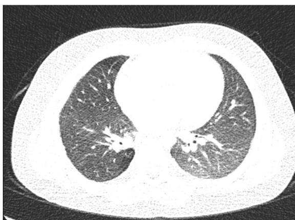
Figure 3 Thorax computerized tomography imaging which is not containing fungal lesions after surgery and posaconazole therapy.

Voriconazole is the primary therapy option for invasive pulmonary aspergillosis. Alternative therapies are liposomal and lipid complex amphotericin B, echinocandins and other