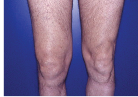
FIGURE 5: Articular involvement in Lyme borreliosis.

In untreated LB the joint manifestations can arise months to years after the tick bite, usually in the form of a chronic mono or asymmetrical oligoarthritis. In our series the musculoskeletal involvement appears to be frequent. A not very painful arthritis characterized by brief attacks of joint swelling (Figure 5) was observed with an incidence comparable to Northern America data [19]. The percentage of acute arthritis evolved in chronic arthritis recorded in this