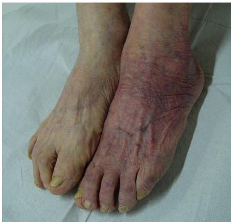
FIGURE 4: Acrodermatitis chronica atrophicans.

1-2% and it is the most common kind of B-cell pseudolymphoma of the skin [1].