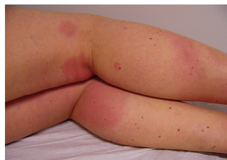
FIGURE 2: Multiple erythema.

The manifestations of LB recorded in this study are similar to the ones of other endemic areas in Europe, presenting a widespread clinical expressivity, even if there are some peculiar features which are different from those reported in Northern Europe and mostly in the USA, proving the existence of several genospecies of Bb differently distributed throughout the various geographical areas [4–10].