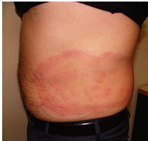
FIGURE 1: Erythema migrans.

Since the relatively high prevalence of antibodies against Bb (5% to 25%) is seen even in healthy persons, depending on their prior exposure to tick bites in their occupational and leisure-time activities [8], in our study, to avoid over-diagnoses, we excluded all seropositive subjects who did not present any other symptom related with LB.