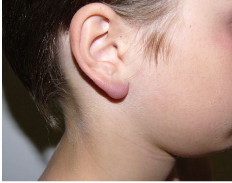
FIGURE 3: Lymphadenosis benigna cutis.