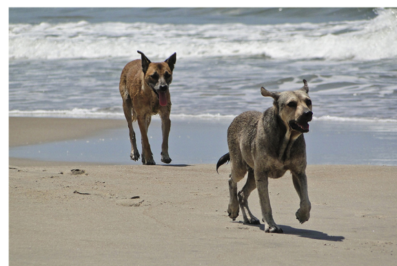
Figure 5 Environmental contamination with dog faeces. Stray dogs roaming freely in a beach in southern Brazil. Dog faeces are an important source of zoonotic parasites that may cause diseases such as cutaneous larva migrans .

Tapeworms are also an underestimated problem in Brazil and other South American countries. For instance, human cases of D. caninum have been described in Brazil [286-288]. Indeed, the high prevalence of D. caninum in dogs in Brazil (e.g., 45.7% in north-eastern and 36.8% in south-eastern Brazil) [32,36] is a consequence of the high prevalence of flea and lice infestations reported in different regions of the country [18,28,30,32,35] and indicates a