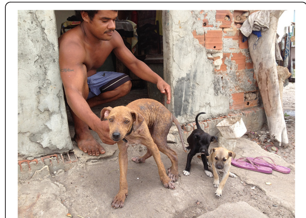
Figure 2 Poor living conditions. An owner and his dogs living in a poor rural community in Goiana, north-eastern Brazil, where visceral leishmaniasis is endemic. In poor rural communities people (as this man in the picture) are used to walking barefoot, which is a risk factor for bare feet-related diseases, such as cutaneous larva migrans and tungiasis.

The diversity of natural environments present in Brazil is outstanding, as is its biodiversity. By the bye, dogs and cats living in Brazil may harbour a long list of parasites that may affect their wellbeing and eventually pose a risk to the health of their owners [8,9]. Information on their distribution, epidemiology, and impact on human health is fragmentary and mainly published in Brazilian journals. In this sense, this article is a compendium on dog and cat parasites in Brazil and a call for a One Health approach towards a better management of some of these parasites, which may potentially affect humans. Practical aspects related to the diagnosis, treatment, and control of parasitic diseases of dogs and cats in Brazil are discussed.