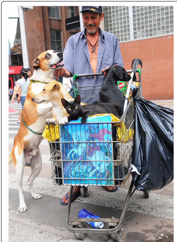
Figure 1 Human-animal bond. A homeless with his inseparable friends that were found abandoned in the streets of Porto Alegre, southern Brazil.

populations in tropical and subtropical regions around the world [5-7]. Furthermore, the impact of some of these diseases is disproportionately higher in developing countries such as Brazil, because the living conditions of the populations often favour the exposure to certain parasites, whose transmission may be associated with poor housing and sanitary conditions (Figure 2), as well as with inequities in the access to education and primary healthcare services.