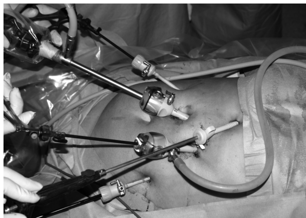
Fig. 1b - Placement of trocars.

NGT was only removed on POD 3 and barium swallow to assess transit was performed on POD 4.