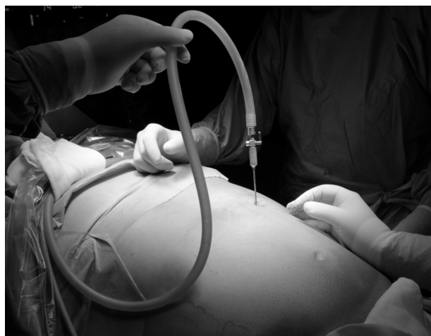
Fig. 1a - Induction of pneumoperitoneum with Veress needle.

The results refer only to the surgical treatment; the other methods provided only transient improvement. The mean duration of the procedure was 105 minutes (range 85-135 min). The NGT inserted before surgery was removed on postoperative day (POD) 1, and patients underwent barium swallow to assess esophageal transit and/or integrity. They recommenced feeding and were discharged on POD 3. There were no major intra- or postoperative complications requiring transfer to intensive care in any patient (23). As already noted, iatrogenic perforation of the distal esophagus occurred in just two cases (8%), both of which were in the early days of our use of the technique. These were treated intraoperatively with direct suturing (3, 24, 25). In these two cases the