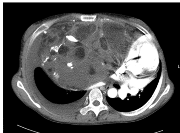
Figure 2 Preoperative computed tomography scan of the abdomen showing a giant solid mass.

before the operation because we were concerned about ventilation if spontaneous respiration was lost. During intubation, her tidal volume (TV) decreased slightly because of weakness of spontaneous respiration, but SpO 2 was maintained and intubation was performed uneventfully. After intubation, midazolam 4mg was administered and anesthesia was maintained with 1.5% sevoflurane. Her TV with spontaneous respiration controlled by pressure support ventilation and positive end-expiratory pressure (PEEP) of 5cmH 2 O was kept between 250 and 350mL.