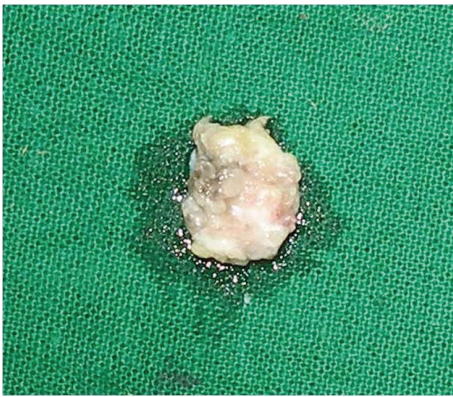
FIGURE 2: Macroscopic view of pedunculated squamous papilloma uvula.

surrounded by stratified squamous epithelium. Multiple papillary folds are hyperparakeratotic and epithelium also revealed plenty of koilocytes (see Figure 3).