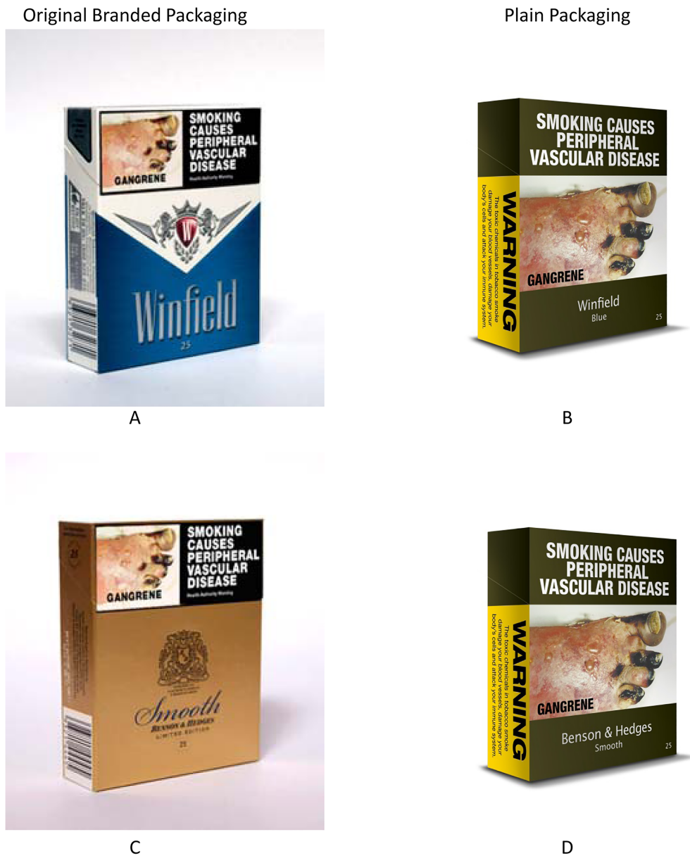
Figure 1 Pack image used for each pack condition within the two by two packaging type (branded vs plain) by brand name (Winfield vs Benson & Hedges) between-subject experimental design.

One notable finding of this research, demonstrating the importance of branding in the tobacco market, was a possible interaction effect between packaging type (branded vs plain) and brand name (Winfield vs B&H). Plain pack images were rated consistently lower than branded images on measures of positive pack, positive smoker and positive taste appeal for the Winfield condition, but no differences were detected for the B&H condition. It might be expected that plain packaging of B&H cigarettes is unlikely to have much effect among socially disadvantaged smokers as this brand is positioned as a premium product at a high price point, 29 with apparent low penetration among this smoker group: only 1.6% of participants reported regularly using B&H cigarettes compared with 9% in the general population. 28 Comparatively, engagement with the