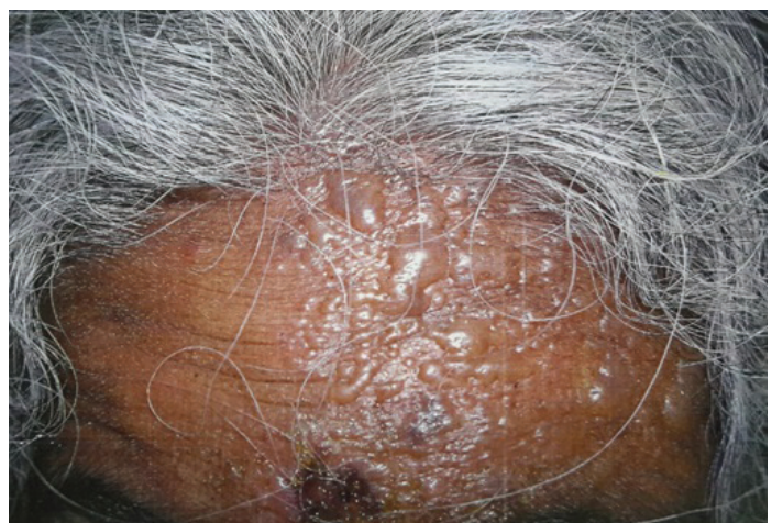
[Table/Fig-8]: Herpes zoster involving left V1 dermatome