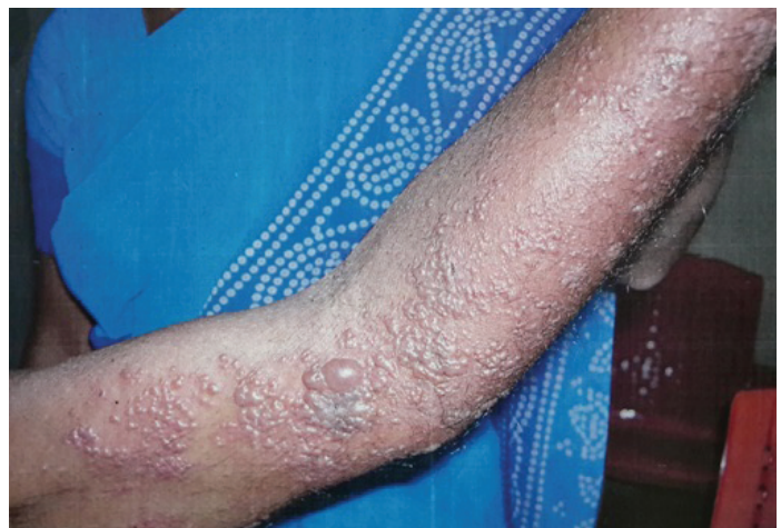
[Table/Fig-9]: Herpes zoster involving left T1 and T2 dermatome