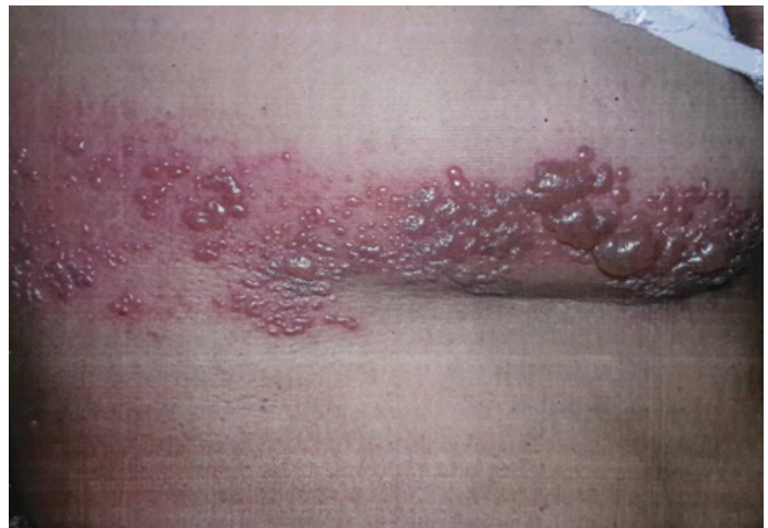
[Table/Fig-7]: Herpes zoster involving right T5 dermatome