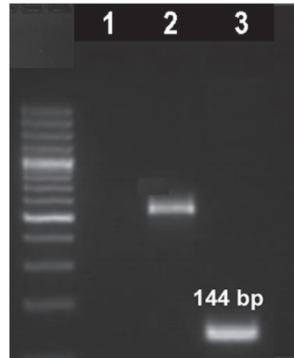
Figure 3. Gel electrophoresis of multiplex reverse transcription-polymerase chain reaction products from the present case. Lanes 1, negative control; 2, internal control ( \beta 2-microglobulin; 535 bp) and 3, ETV6-MDS1-EV11 fusion transcript (144 bp). MDS1, myelodysplastic syndrome; EV11, ectopic viral integration site 1.

20 metaphase cells derived from unstimulated bone marrow culture were analyzed. Karyotypes were described according to the International System for Human Cytogenetic Nomenclature (12).