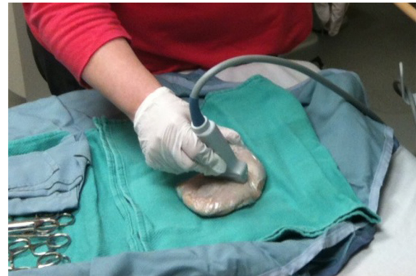
Figure 1 Experimental model consisting of plastic-wrapped chicken thighs containing FBs or none, with a 1-cm incision.

Wood, metal and plastic FBs were inserted randomly by an independent observer (also a trained POCUS instructor) into the muscle layer of eight experimental models at a depth of 10 to 15 mm. FBs measured 15 to 20 mm in length and 1 to 3 mm in diameter. Control experimental models had no FB inserted. The independent observer recorded which materials were present in each model. All models had a 1-cm incision made on