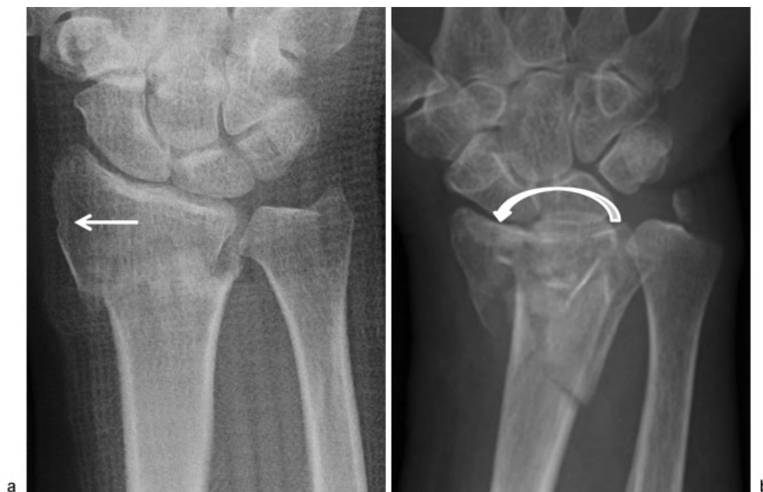
Fig. 3 Radiographs of (a) radially displaced (white arrow) fragment and (b) severely decreased radial inclination (white round arrow).

average 4.7 mm of radial translation, while average 0.1 mm of radial translation was noted in the 16 wrists with intact RUL. The radial inclination ranged from -9^{\circ} to 28^{\circ} with an average of 16.7^{\circ} totally, indicating average 11.5^{\circ} in 13 wrists with RUL avulsion ( \rightarrow Fig. 3b) and average 21.0^{\circ} in 16 wrists without RUL avulsion. Radial shortening averaged 4.86 mm (range: 0 to 15.6 mm). In the wrists with RUL avulsion the average radial shortening was 6.7 mm, compared to radial shortening of 3.4 mm in the wrists with an intact RUL. The average ulnar variance was +2.9 mm (range 0–7.2 mm). In the wrists with an RUL avulsion the average ulnar variance was +3.0 mm, and the wrists with an intact RUL had an average of +2.9 mm. The volar tilt ranged from -35^{\circ} to 35^{\circ} (average -8.4^{\circ} ); -12.1^{\circ} in the wrists with an avulsed as compared with 5.4^{\circ} in the wrists with an intact RUL. Radial translation of the ulnar styloid fragment of more than 4 mm was found in 7 wrists with a RUL avulsion. Twenty-two wrists did not have any displacement of the ulnar styloid fragment: six of these wrists had a RUL avulsion, whereas 16 wrists had an intact RUL.