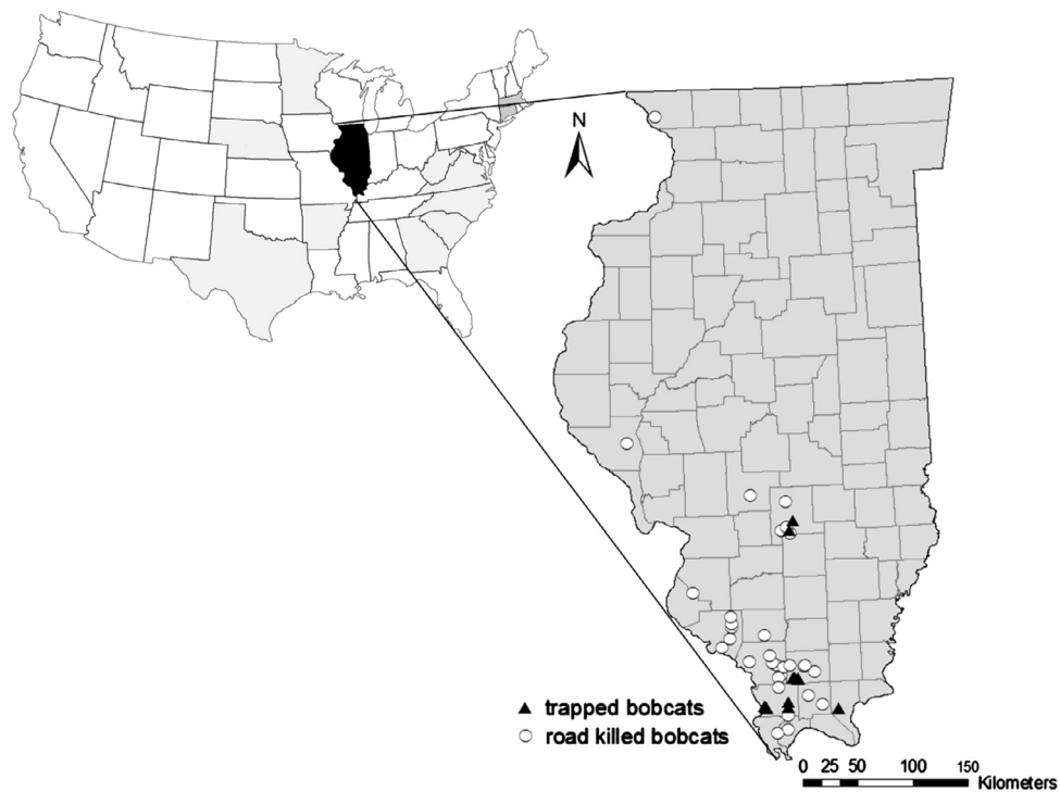
Figure 1. Collection locations for trapped (13) or road killed (32) individuals used to characterize infections suffered by bobcats ( Lynx rufus ) in Illinois during 2003–2012. States where other surveys have been completed are shaded gray.

deposited in the United States National Parasite Collection (USNPC, Bethesda, Maryland).