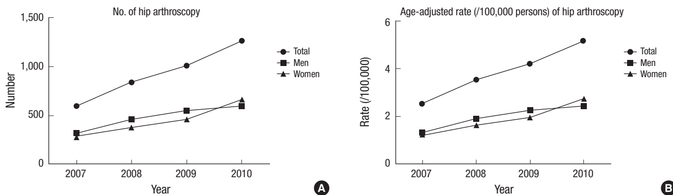
Fig. 1. Total numbers (A) and age-adjusted rates (per 100,000 persons) (B) of hip arthroscopy for men and women.