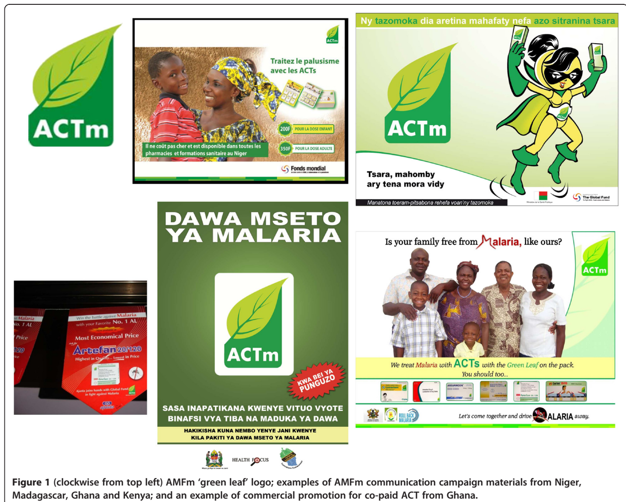
Figure 1 (clockwise from top left) AMFm 'green leaf' logo; examples of AMFm communication campaign materials from Niger, Madagascar, Ghana and Kenya; and an example of commercial promotion for co-paid ACT from Ghana.

Communication campaigns, including the use of mass media, have been used alone or as components of interventions to address a variety of public health problems in low and middle income countries including HIV prevention, family planning promotion, and the use of insecticide-treated bed nets for malaria control [5]. The effectiveness of such campaigns on behaviour change