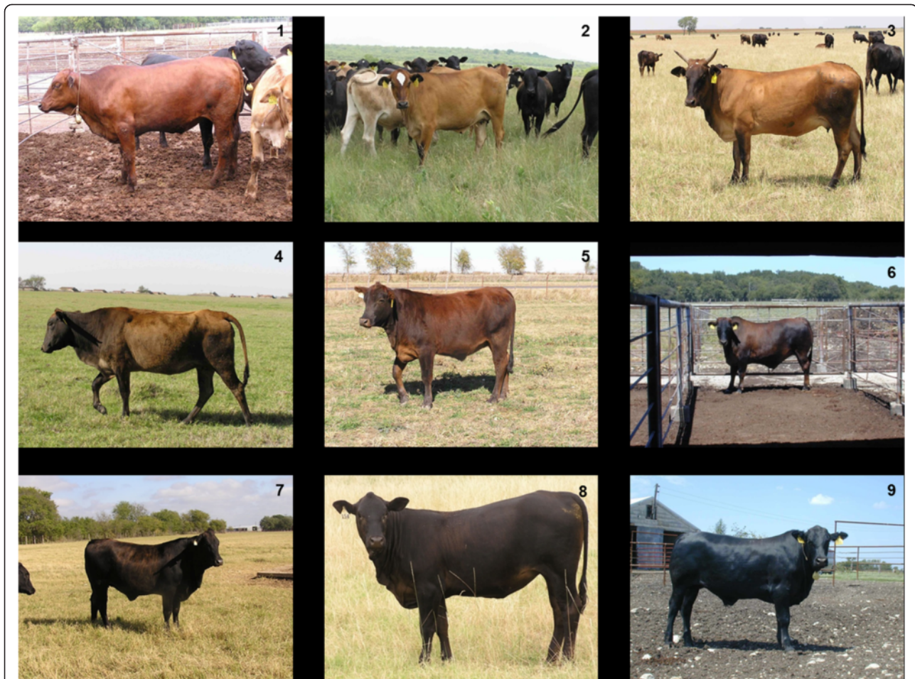
Figure 1 Degree of black scoring system. Examples of E^{D^+}E^+ F_2 Nellore-Angus cattle that scored a 1 through 9, respectively, starting at the top left and proceeding left to right down the rows.

every family was used for interval analyses by applying the full sibling additive and dominance models of GRIDQTL software [7], with 1 cM steps assuming 1 cM = 1 Mb, chromosome-wise significance thresholds established by 5000 permutations of the data, and the 95% confidence interval was established by 5000 bootstraps with resampling. Single-marker association analyses were performed using PLINK [8] for 39 480 SNPs with Bonferroni correction for multiple tests.