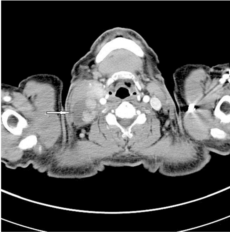
Figure 1. CT manifestation of PTC (white arrow).