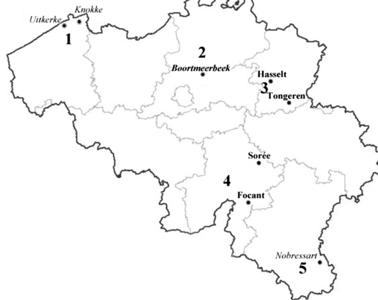
Figure 3 Location of the ponds where Fasciola sp. infected snails species were found: 1) Polders, 2) Sand region, 3) Loam region, 4) Chalk region, 5) Gutland; Bold for G. truncatula ; Italic for Radix sp.; Italic and bold for pond where G. truncatula and Radix sp. were found infected.

intermediate hosts in Belgium. One hundred and twenty five ponds and sixteen other interesting areas in five different biogeographic regions in Belgium and Luxembourg were sampled for snails with environmental factors information. In Belgium in 2008, winter and spring were particularly mild. Furthermore, during that summer the rainfall and the number of rainy days were quite abnormal (Royal Meteorological Institute of Belgium; http://www.meteo.be ). Those conditions are the most suitable for snail development. More than half of these biotopes (53.2%) were colonized with lymnaeid snails. Soil composition in Flanders (sand, silt) in Polders, Sand Region, and Loam region seem to be suitable for the development of lymnaeid snails. A great diversity in shell morphology with extremely homogenous anatomical traits created a great confusion regarding the systematics of lymnaeids especially